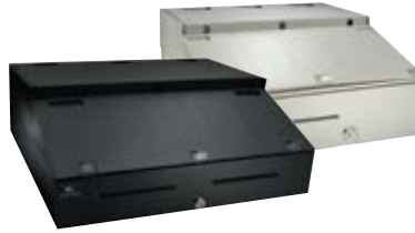
Black / Cloud White

Designed to help bring all the components of a POS workstation together, the Cash Drawer Caddy System includes a heavy duty drawer, a rugged injection molded Base and a sturdy steel Cap. The system allows for peripherals to be placed with left or right-hand orientation and accommodates nearly all major POS keyboard, printer and monitor brands.