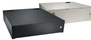
Black / Cloud White

An accessory to the Cash Drawer Caddy System, APG's Caddy Garage takes POS integrated systems to a new level. Now part of the POS component "stack," the PC, along with cabling, fits inside the ventilated Caddy Garage. Removable front and rear latching panels make cable routing easy and hide the PC from view.