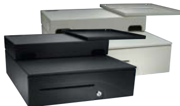
Black / Cloud White

A compact foundation for your POS system, the POS-Integrator provides a solution to the problem of assembling systems on a Series 100 cash drawer. Exploiting the use of a narrow footprint, a riser and printer tray expand the width to accommodate various receipt printers and a full size monitor. Cable management is provided to route and hide peripheral cables.