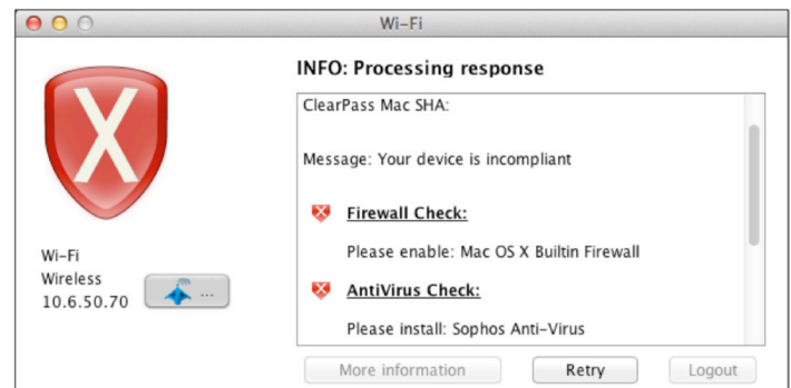
Detailed Mac OS X quarantine message.

Messages can include reasons for remediation, links to helpful URLs and helpdesk contact information. Aruba ClearPass OnGuard agents provide the same message and remediation capabilities for 802.1X, non-802.1X, and combined environments.