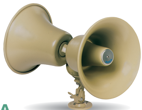
SPT15A, SP158A, SPT30A<sup>+</sup>, SP308A<sup>+</sup>