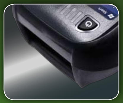
Overmold reinforced polycarbonate structure survives drops of 1.8 m (6 ft) and seals to an IP64 protection class