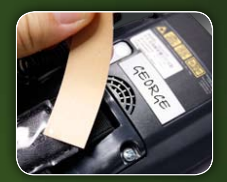
Reserved label area for customer identifiers