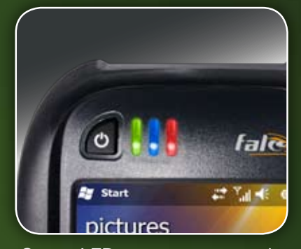
Status LEDs: power, scan and keyboard status