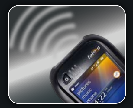
Summit IEEE 802.11a/b/g radio with diversity antenna and CCX v4 security