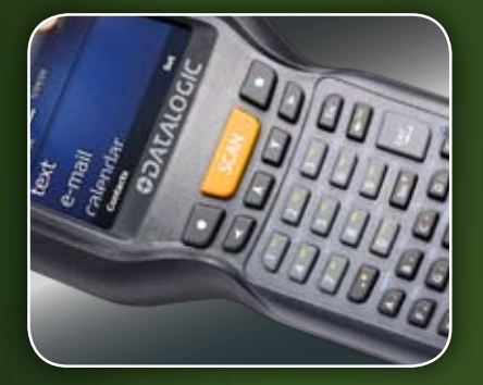
Contoured shape promotes single handed use