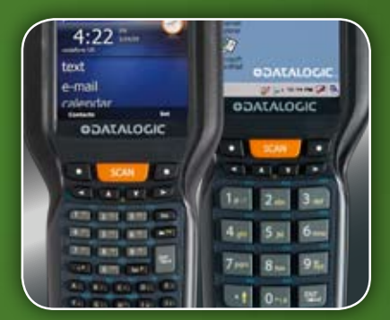
Numeric keyboard & full alpha-numeric keyboard