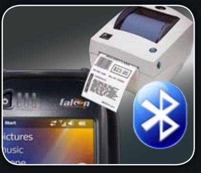
Bluetooth® wireless Communications 2.0 EDR for simultaneous connections with lower power consumption