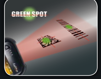
Green Spot™ Technology