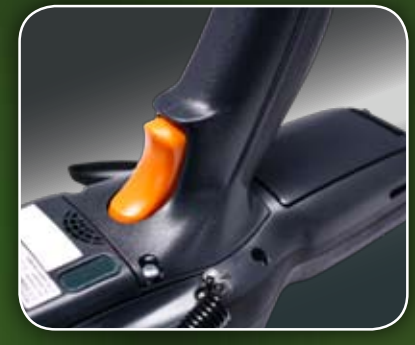
Pistol grip handle with finger rest for balance and control