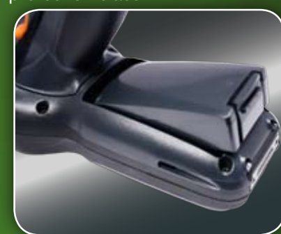
Single piece battery