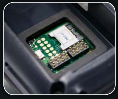
Memory: 256 MB RAM / 256 MB Flash with MicroSD memory expansion