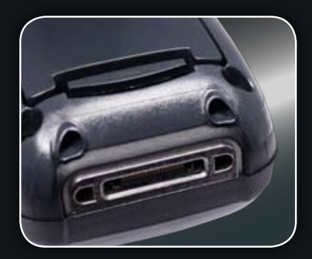
Main connector with secure connection to serial, USB, or audio