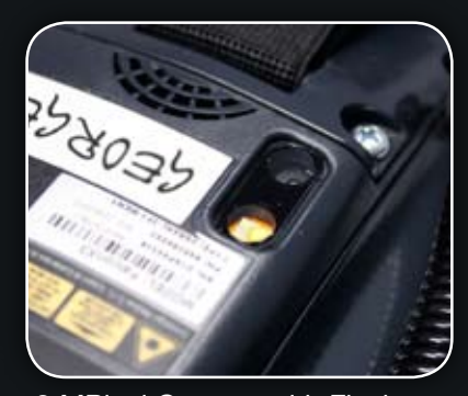
3 MPixel Camera with Flash