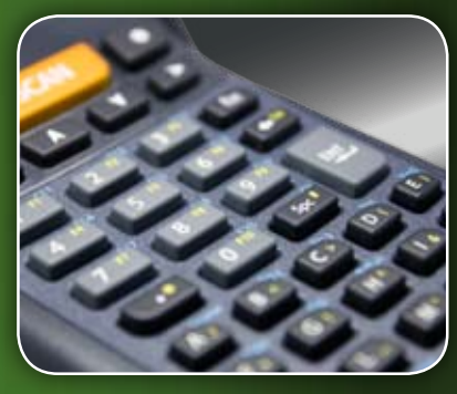
Polycarbonate key caps