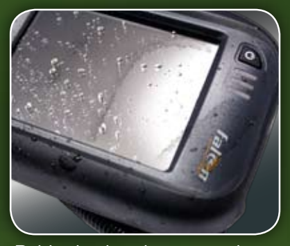
Rubberized seals prevent dust and water intrusion to an IP64 protection class