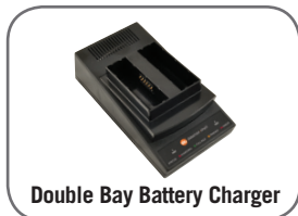
Double Bay Battery Charger