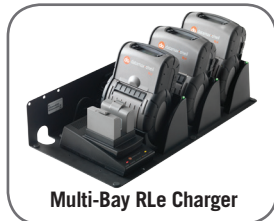
Multi-Bay RLe Charger