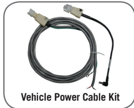
Vehicle Power Cable Kit