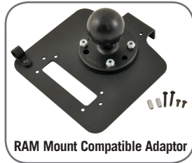
RAM Mount Compatible Adaptor