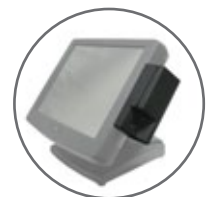
MSR and Fingerprint Reader