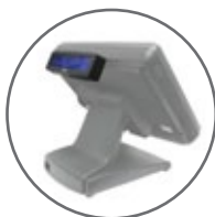
Rear Mount Display