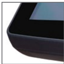
Projected Capacitive Comes with a Sleek Flat Precision-edge Screen