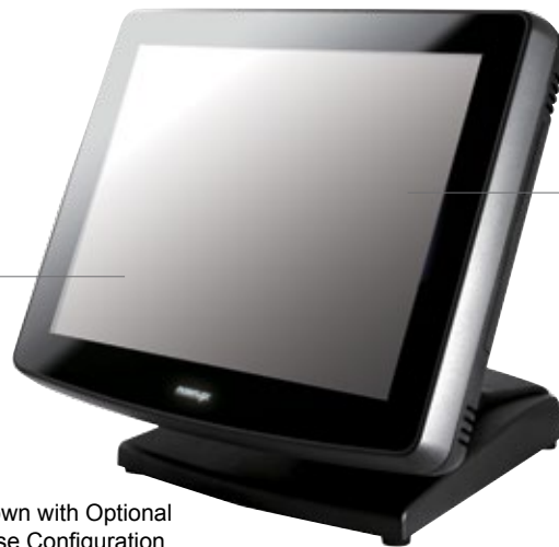
Shown with Optional Base Configuration