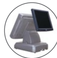
Secondary Rear Monitor