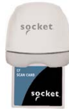
CF Scan Card 5XRx

Designed for healthcare professionals, the Socket CompactFlash Scan Card 5XRx incorporates antimicrobial materials that provide an extra layer of protection to the product to protect against the multiplication and spread of potentially harmful bacteria and microbes. Delivering superior barcode scanning performance in a CompactFlash (CF) form factor, the CF Scan Card 5XRx is an ideal data collection tool for the most demanding healthcare applications and environments.