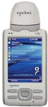
CF Scan Card 5XRx with Socket SoMo® 650Rx handheld computer (sold separately)