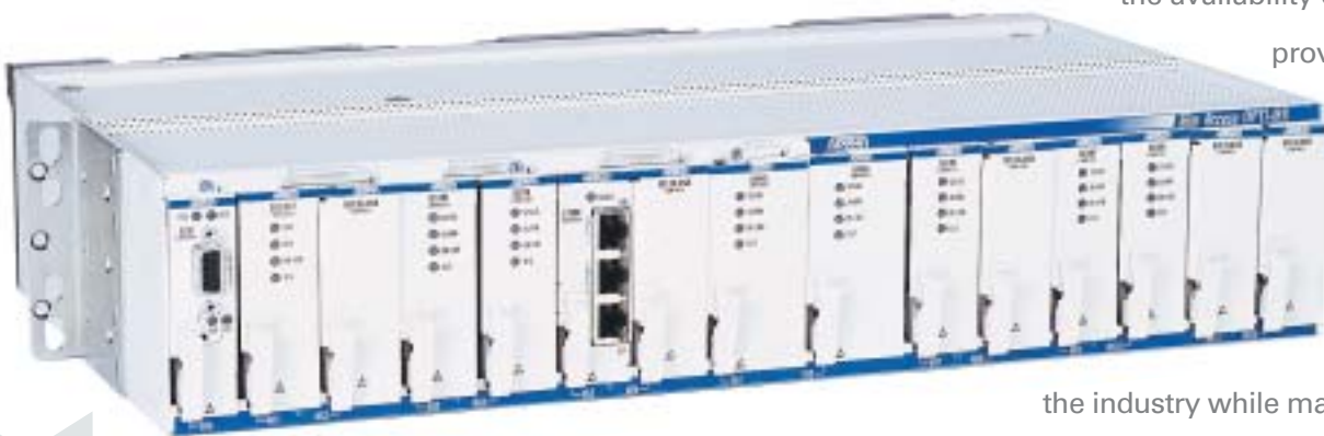
Total Access OPTI-MX

the industry while maintaining the standards and procedures for existing SONET networks.